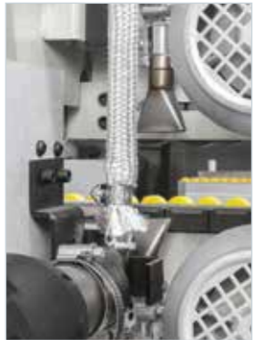
ID 3000 edge brightening unit It brightens the colour of plastic edges by heating them with hot air.