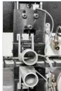
RC-N glue scraping unit It eliminates any glue excessing in the joint between edge and panel. Nesting processing.