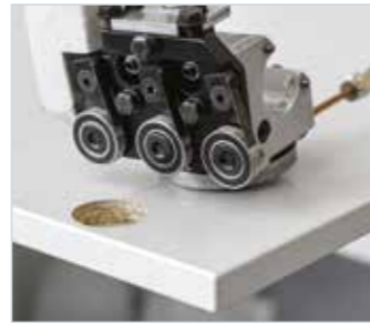
Nesting kit To process panels coming from nesting cycle.