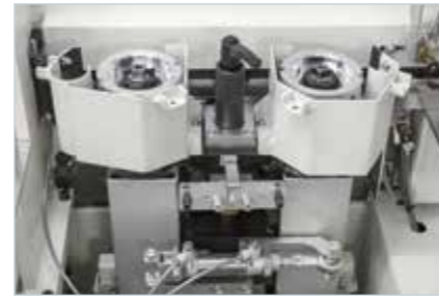
RT-V1 premilling unit A perfect panel surface for an excellent joint line.