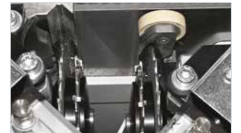
K-2 Radius end cutting unit Cut and radius in a single operation.