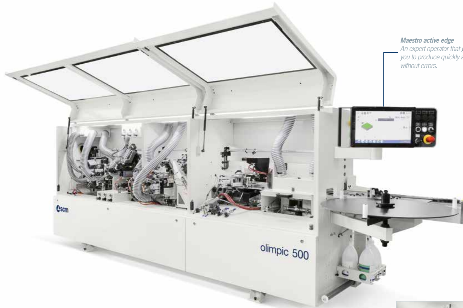
Maestro active edge An expert operator that guides you to produce quickly and without errors.