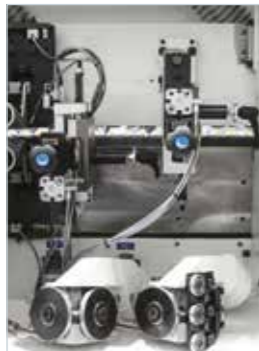
RAS-A edge scarping unit Simple and quick change of the machining radius with the replacement of the tool kit.