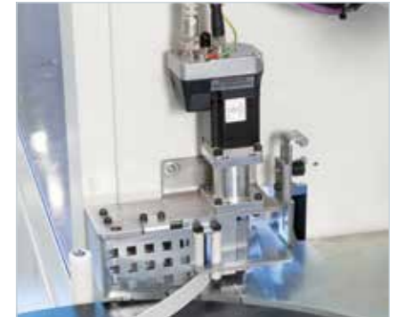
Kit for the automatic edge loading Fast, simple and safety edge changeover.