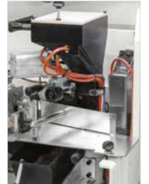
SGP-E glue pot Perfect joint line and use of EVA and PUR glue.