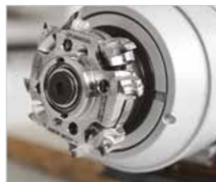
Round 2-A unit 2-motor unit and Multiedge device for machining 2 different radii, each with a dedicate tool.