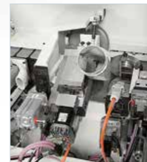
R-HP Trimming-Chamfering unit Quick changeover between 2 different radii, infinite thin edges and solid wood tipping thanks to Multiedge devices.